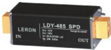
Appearance and installation dimension