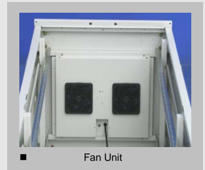
■ Fan Unit