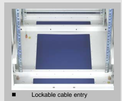
■ Lockable cable entry