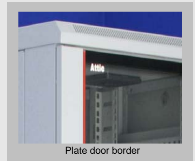
Plate door border