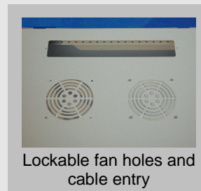
Lockable fan holes and cable entry