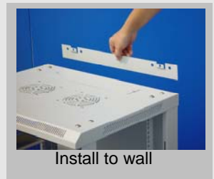
Install to wall