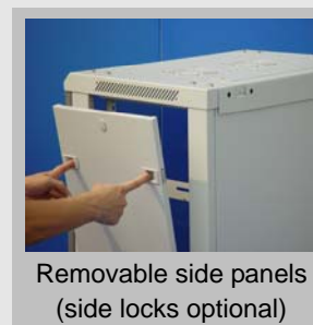
Removable side panels (side locks optional)